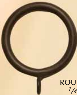
350 ROUND RING 1/4" Thick