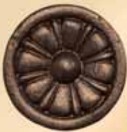
304 PEG 1 2 3 / 4 " DIA