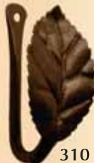
310 HOOK PEG L2 3 / 4 " H3 1 / 2 "