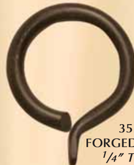
353 FORGED RING 1/4" Thick