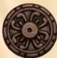
305 PEG 2 2" DIA