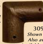
309 ELBOW Shown as 90° Exterior Also available as 45° Available as Interior Fitting.

Angle can be modified, additional charges apply