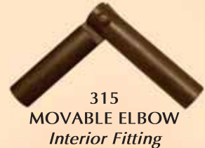
315 MOVABLE ELBOW Interior Fitting