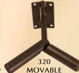
320 MOVABLE CORNER BRACKET 3" to 4 1 / 2 " P Interior Fitting