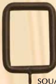
352 SQUARE RING 1/4" Thick

We recommend ring size to be 1/2" LARGER than rod diameter.