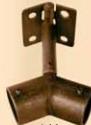
312 CORNER BRACKET 3" to 4 1 / 2 " P, shown as 45° Also available as 90°