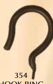
354 HOOK RING 1/4" Thick