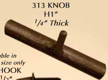
313 KNOB H1" 1/4" Thick

Must order interior Elbow (#309) to fit inside Mitered Corner