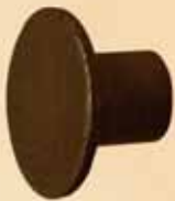
301 CAP Interior Fitting