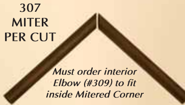
307 MITER PER CUT

Must order interior Elbow (#309) to fit inside Mitered Corner