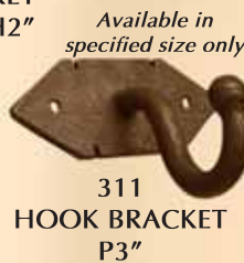
311 HOOK BRACKET P3"