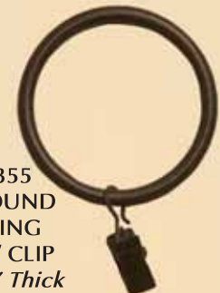
355 ROUND RING W/ CLIP 1/4" Thick

We recommend ring size to be 1/2" LARGER than rod diameter.