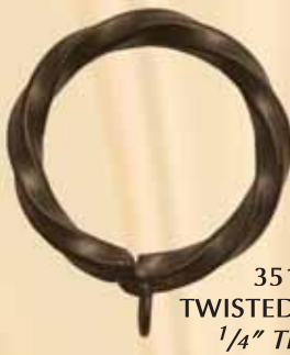
351 TWISTED RING 1/4" Thick