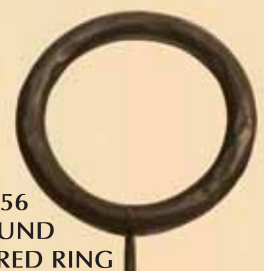
356 ROUND HAMMERED RING 1/4" Thick

Eyelets can be modified as per drawing, additional charges apply.