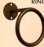
316S (Small) 3" to 5" ID 3/8" thickness