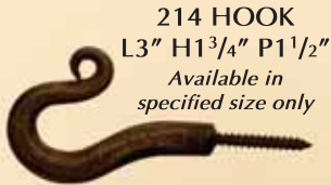
214 HOOK L3" H1 3 / 4 " P1 1 / 2 " Available in specified size only