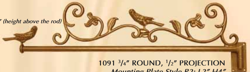
1091 3/4" ROUND, 1/2" PROJECTION Mounting Plate Style R2: L2" H4" Minimum length 36", shown as right