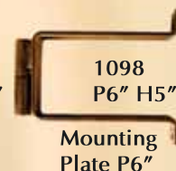
1098 P6" H5"