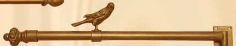
1093 1" ROUND, 1/2" PROJECTION Mounting Plate Style R2: L2" H4", shown as right Movable Finial (#929MV) at additional charge.