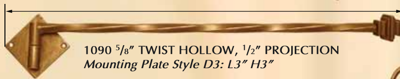
1090 5/8" TWIST HOLLOW, 1/2" PROJECTION Mounting Plate Style D3: L3" H3"