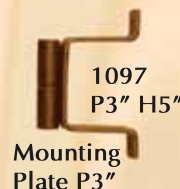
1097 P3" H5"