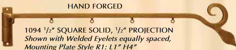
HAND FORGED 1094 1/2" SQUARE SOLID, 1/2" PROJECTION Shown with Welded Eyelets equally spaced, Mounting Plate Style R1: L1" H4"