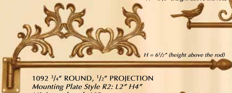
1092 3/4" ROUND, 1/2" PROJECTION Mounting Plate Style R2: L2" H4" Minimum length 18"