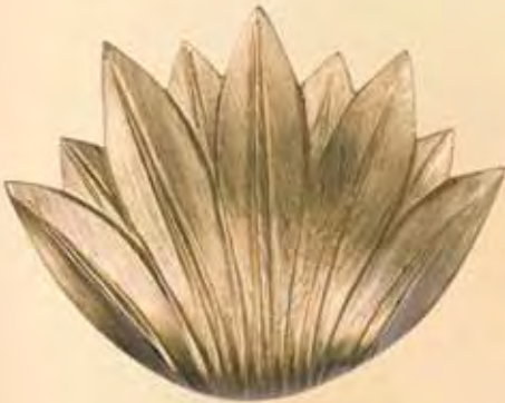
DAHLIA TIEBACK 5095 L4 5 / 8 " H6" Shown in Rich Gold

Tiebacks available as "U" Shape Bend or with Post Projection. Available in Iron Art and Wood Art Finishes.