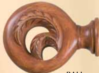
BALI 5065 L5 1 / 2 " H4" Shown in Natural