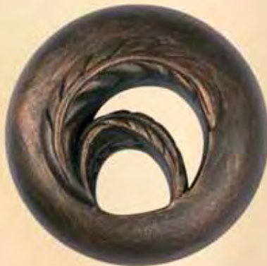
BALI TIEBACK 5096 4 5 / 8 " DIA Shown in Antique Copper