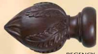
REGENCY 5088 L6 3 / 4 " H4" Shown in Mahogany