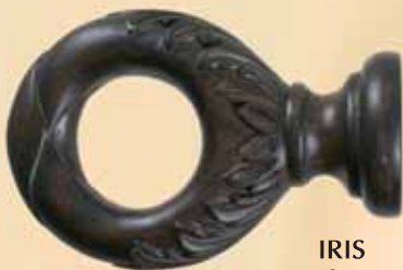
IRIS 5083 L6 3 / 4 " H4 1 / 2 " Shown in Burnt Gold