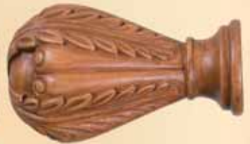
HAMPTON 5063 L6" H2 1 / 2 " Shown in Natural