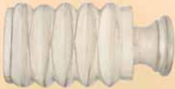
TOWER 5064 L6" H3" Shown in Antique White