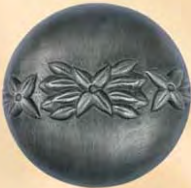
TIFFANY TIEBACK 5098 4 1 / 2 " DIA Shown in Soft Pewter