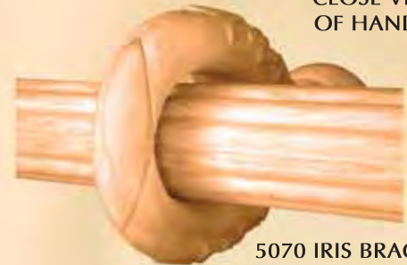
5070 IRIS BRACKET P6 3 / 4 " Bracket 2" Pole only Shown in Unfinished