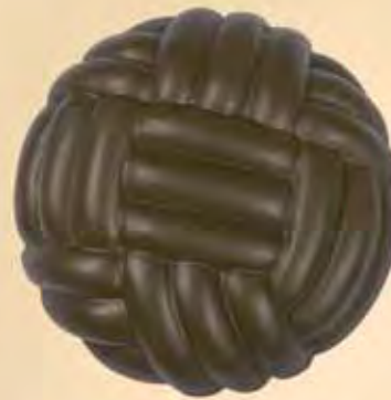
MING TIEBACK 5097 4 1 / 2 " DIA Shown in Light Brown