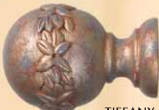
TIFFANY 5086 L5" H4" Shown in Imitation Gold Leaf