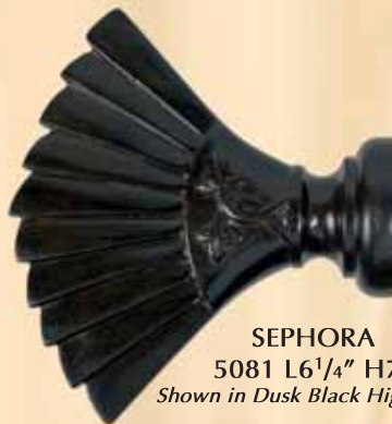
SEPHORA 5081 L6 1 / 4 " H7" Shown in Dusk Black High Gloss