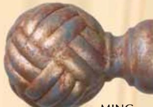
MING 5087 L5 1 / 4 " H3 3 / 4 " Shown in Imitation Gold Leaf