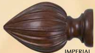
IMPERIAL 5085 L7" H4" Shown in Light Cherry