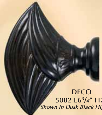
DECO 5082 L6 3 / 4 " H7" Shown in Dusk Black High Gloss