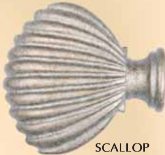
SCALLOP 5061 L5 1 / 2 " H5 1 / 4 " Shown in Burnt Silver