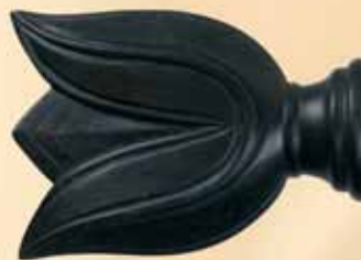
DAFFODIL 5066 L5 1 / 2 " H3 3 / 4 " Shown in Dusk Black