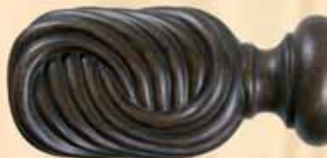
STRATA 5084 L7" H3 1 / 4 " Shown in Aged Pewter