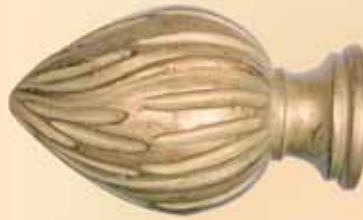
HALLARD 5062 L6 1 / 2 " H3 1 / 4 " Shown in Sage Gold