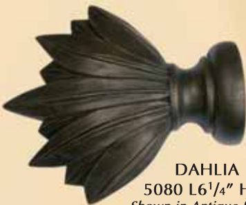
DAHLIA 5080 L6 1 / 4 " H6" Shown in Antique Bronze