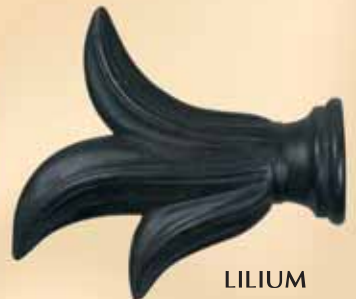
LILIUM 5067 L6" H5" Shown in Dusk Black