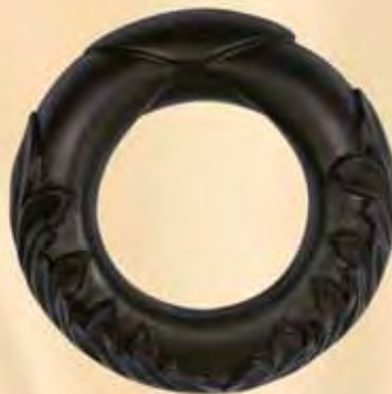
IRIS ACCENT TIEBACK 5099 4 1 / 2 " DIA Shown in Dark Brown